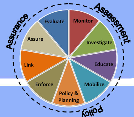
Core Functions of Public Health